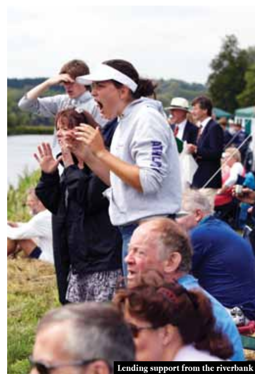
Lending support from the riverbank

the bars to organising the marquees to the public address system and jazz bands," says Pippa.