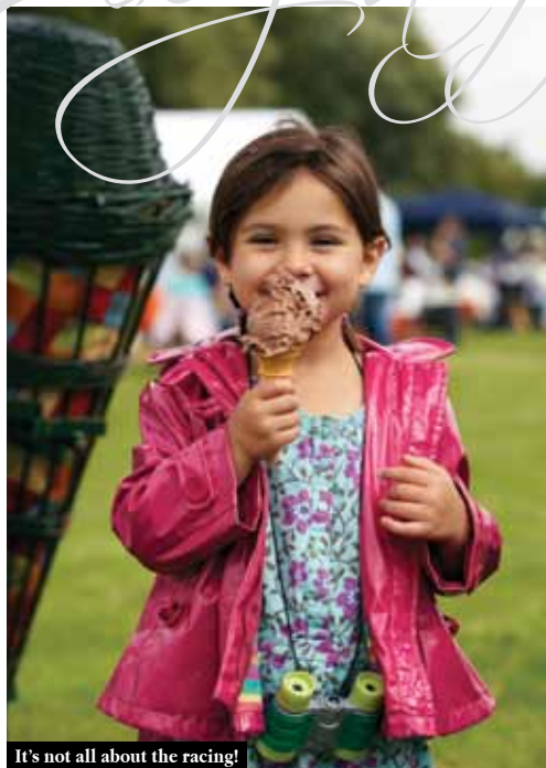
It's not all about the racing!