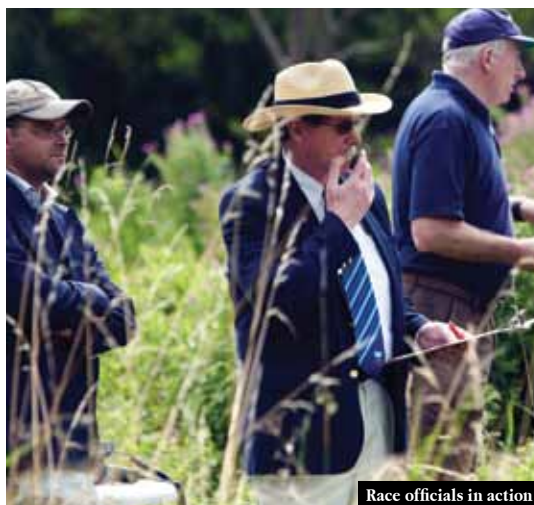
Race officials in action