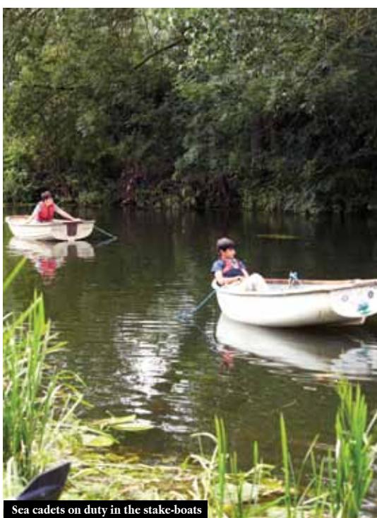
Sea cadets on duty in the stake-boats