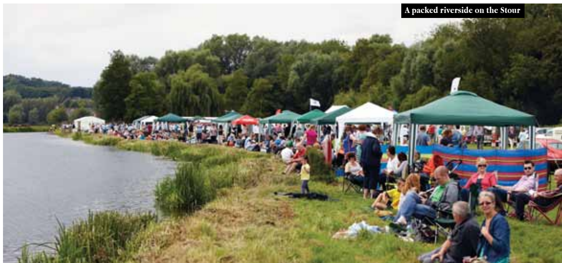
A packed riverside on the Stour

Would you like your club's event to be part of the Row for Gold series? Find out more online at www.britishrowing.org