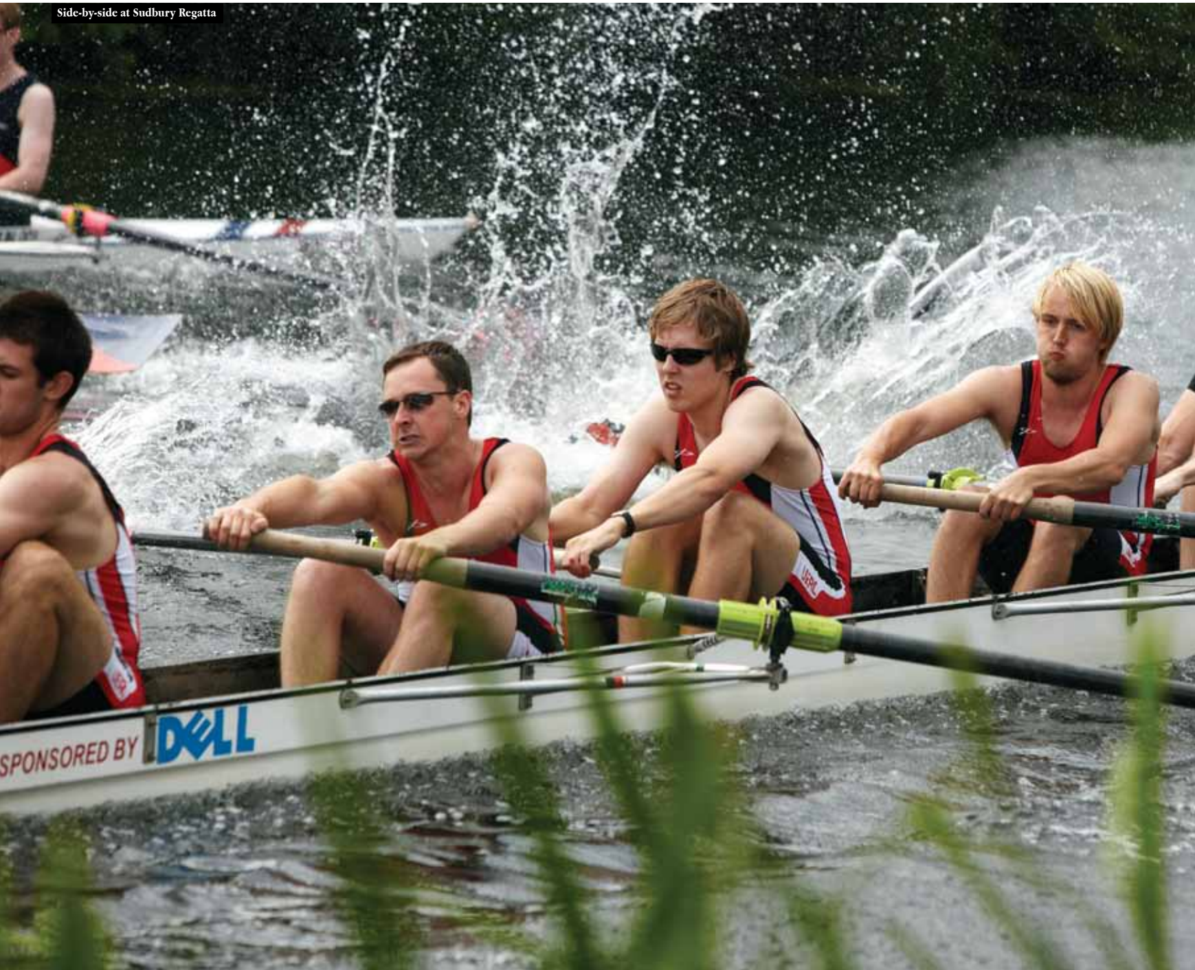
Side-by-side at Sudbury Regatta

“The racing is really hard and really serious, but it’s got a different feel to the regattas where you have a multi-lane course”